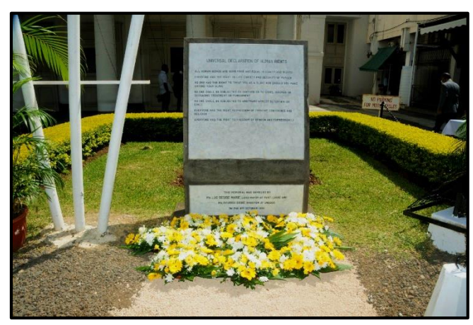
Monument of the Universal Declaration of Human Rights