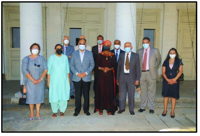
Wreath Laying ceremony