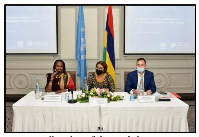
Opening of the workshop

The two-day workshop was attended by representatives of Ministries/Departments, National Human Rights Institutions and Non-Governmental Organisations.