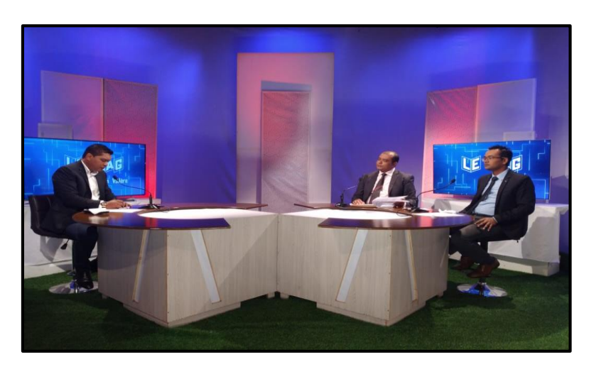
Recording in the MBC radio studio

Furthermore, a radio talk was organised and broadcasted on MBC Radio and Facebook Live along with the participation of Officers of the National Disaster Risk Reduction and Management Centre and the Ministry of Environment, Solid Waste Management and Climate Change (Environment and Climate Change Division), who are stakeholders of the International Humanitarian Law Committee of Mauritius, falling under the aegis of the Human Rights Division.